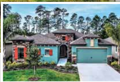
641 Elk River Drive — Gorgeous 3 bedroom, 3 bath Vienna model with summer kitchen and BRAND NEW pool. Beautiful tile floors everywhere except bedrooms. Tray ceilings in living area and master suite, and granite kitchen with oversize island. Absolutely perfect! Available at $425,000