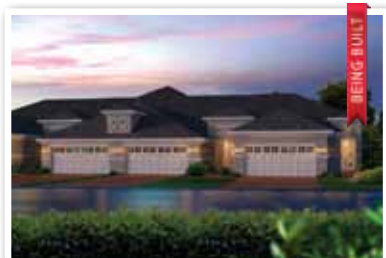
The Arbor II

744 Aldenham Lane, Ormond Beach, FL 2 Bedroom + Study / 2 Bath / 2 Car / 1,562 ft 2 $239,070