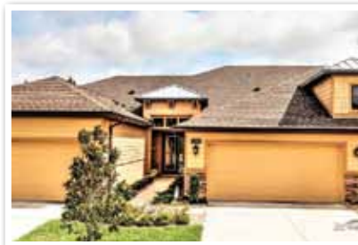
1221 Kilkenny Court — Upgraded two-story townhome with 2 bedrooms, 3 baths, den, and LARGE bonus room. Ceramic tile in main areas with carpet in others. Granite kitchen with new deep sink and island lighting. Overlooking large lake and fountain. Offered at $248,000