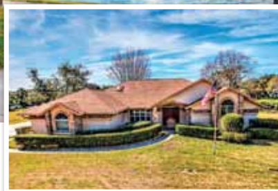
34 Magnolia Drive — Meticulously-maintained 3 bedroom, 3 bath golf course home with lake views. Cathedral-style ceilings, updated kitchen with solid-wood cabinetry and granite countertops. Exceptionally-large covered lanai with million dollar views!! Offered at $369,900