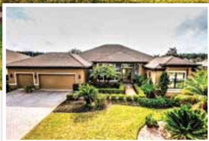
821 Westlake Drive — Beautiful 4 bedroom, 3 bath Preakness model with pool/spa and wonderful lake views. Tile laid on the diagonal, crown molding in most areas, granite kitchen, generous master suite overlooking pool and lake. Offered at $485,000