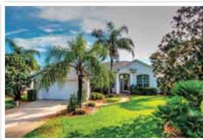
71 Bridgewater Lane — Lovely 3 bedroom, 2 bath with office/den. Vaulted ceilings and master suite with beautiful en suite. Kitchen offers white, raised-panel cabinetry, breakfast bar, and café. Covered lanai overlooks very private backyard. Garage with w/golf cart entrance. Available at $279,900