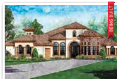
The Egret II

622 South Lake Drive, Ormond Beach, FL 4 Bedroom / 3.5 Bath / 3 Car / 2,740 ft 2 $453,030