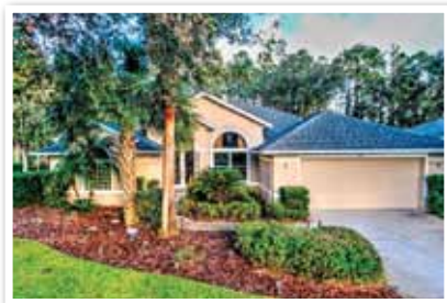
40 Meadow Brooke — Exceptional 3 bedroom, 2 bath pool home backing to preserve. Open floorplan with large living area opening to covered lanai and pool. White kitchen w/pool view café. New carpeting and recently painted inside and out. Offered at $315,000